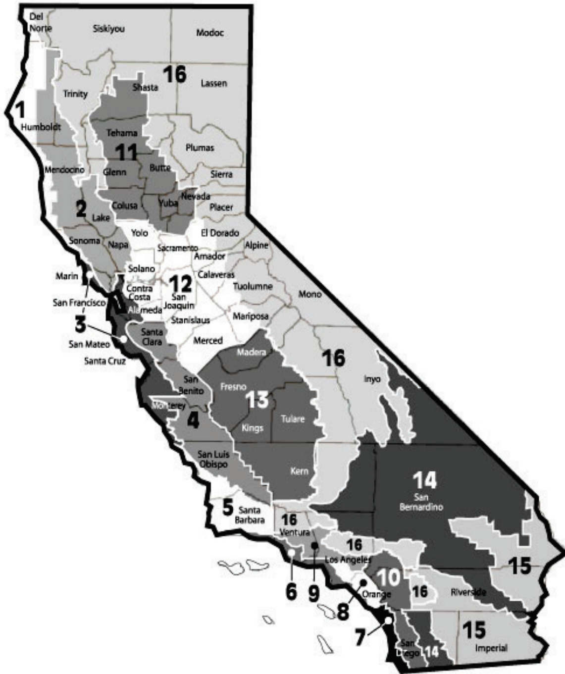
Figure 1-1: California Climate Zones